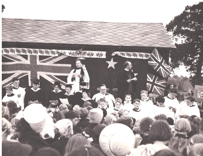
Above: Byfleet Coronation Celebrations June 3 rd 1953. The choir is present. Is this Vickers Sports Ground?