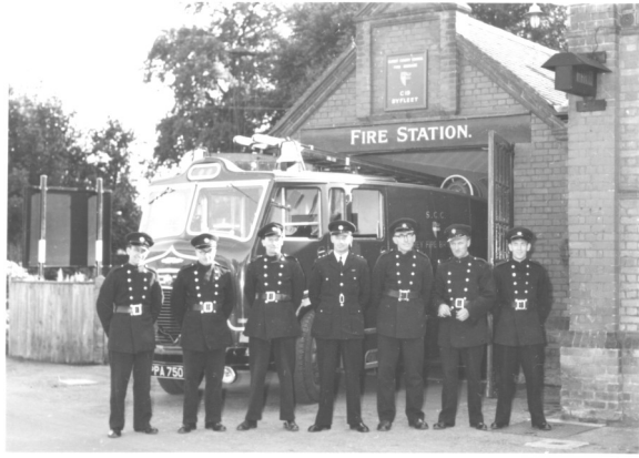
Byfleet Fire Brigade outside the fire station in 1963

Below: Two pictures from Parish Day. We think the team in the top picture might be Vickers Tug of War team—can anyone confirm this? Below is a rather fine flying saucer. Does anyone remember when this made an appearance?